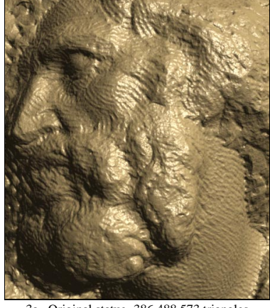
3a. Original statue. 386,488,573 triangles.