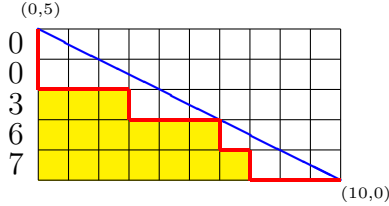
FIGURE 1. The (10, 5) -Dyck path encoded as 76300.

An (m, n) - Dyck path is a south-east lattice path, going from (0, n) to (m, 0) , which stays below the (m, n) - diagonal , which is the line segment joining (0, n) to (m, 0) . See Figure 1 for an example.